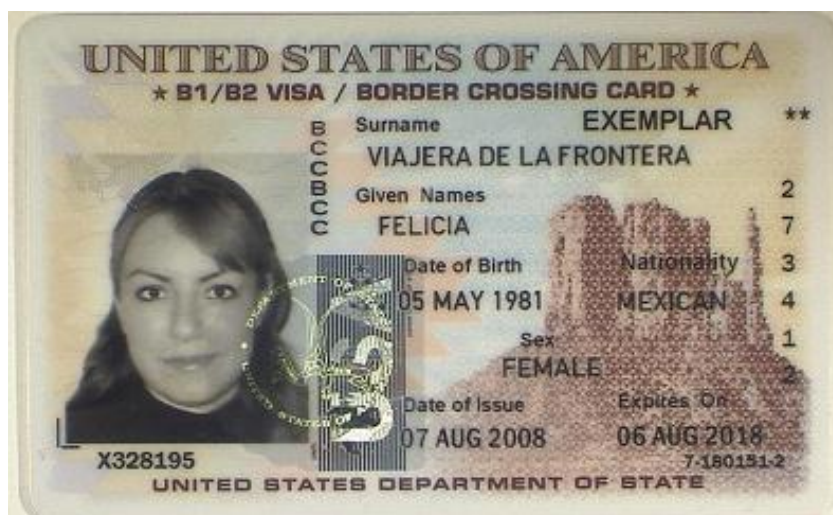
Figure 4: Sample Border Crossing Card (B1/B2 Visa)

The lack of federally supported tourism promotion in Mexico can be thought of as a “soft” barrier to increased tourism from that country. A far more significant challenge is the visa process to be admitted into the U.S. This process continues to be a cumbersome constraint for Mexico’s growing middle class who want to visit our national parks, shopping malls and theme parks and stay in our hotels. As mentioned above, Mexico is not included in the U.S. Visa Waiver Program. Instead, Mexicans who wish to travel to the United States are required to apply for a Border Crossing Card, a type of B1/B2 non-immigrant visa that is specific to citizens of Mexico (see Figure 4 below).