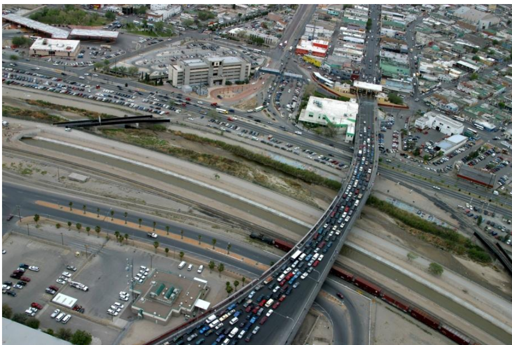
Vehicles waiting to enter El Paso from Ciudad Juarez.