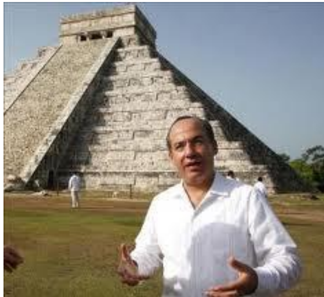
President Calderón promotes tourism to Mexico. Screen shot from "Mexico: The Royal Tour."

SECTUR has engaged in tourism marketing campaigns throughout the world. A recent effort that has made a significant media impact was the "México: The Royal Tour" campaign. President Felipe Calderón hosted the campaign himself and introduced potential visitors to some of Mexico's most appealing tourist sites. The Royal Tour was produced and broadcast in the U.S. by PBS at no cost to Mexico's government due to the sponsorship of three private entities. According to SECTUR, the campaign had an audience of 100 million people in the U.S. and 300 million people in rest of the world. Innovative partnerships may serve as a model for the United States as our federal government puts together its tourism promotion in Mexico and the rest of the world.